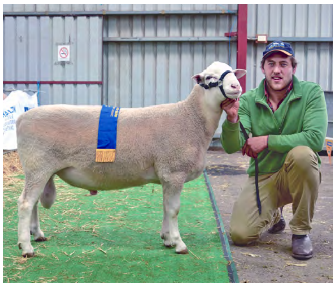
Anden 160061 – Lot 49 Senior WS Champion Ram 2017 Hamilton Sheepvention