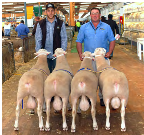
Anden White Suffolks winning the Lamb Production Class for Trade and the Lamb Production Class for Export at the 2015 Royal Adelaide Show.